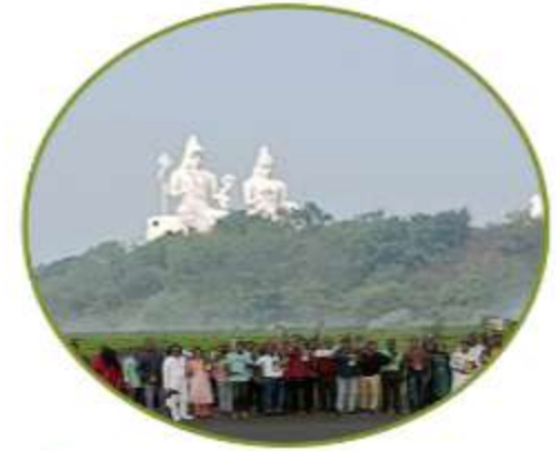
ICHAPURAM ETOR CITY - 3