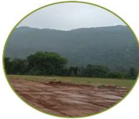
SOTTADVALASA ETOR CITY - 2