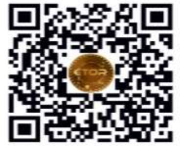
QR for Google Location