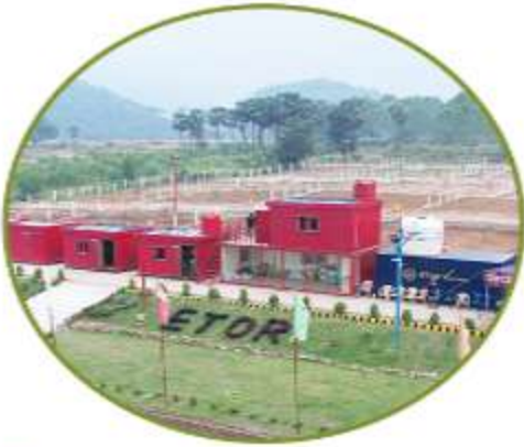
SARIAPALLE ETOR CITY - 1